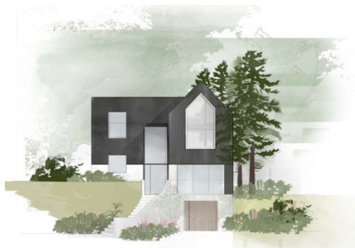
House 1, north elevation Proposed development